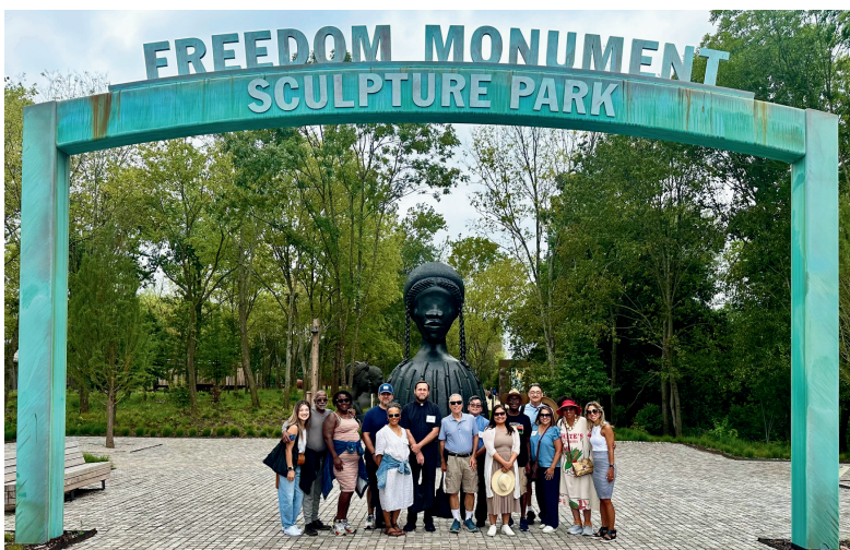
Pilgrimage to Montgomery, AL