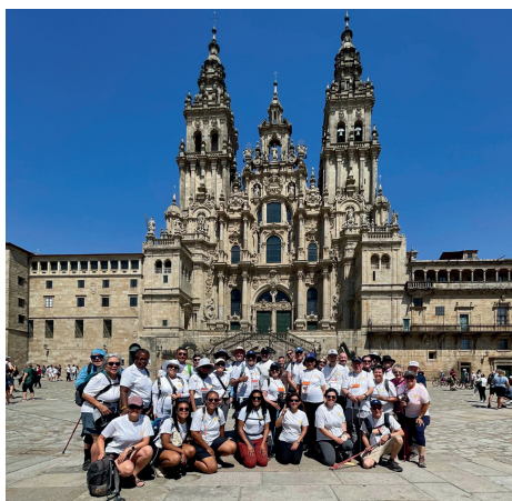
Camino de Santiago