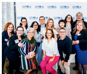
Hearts on Fire