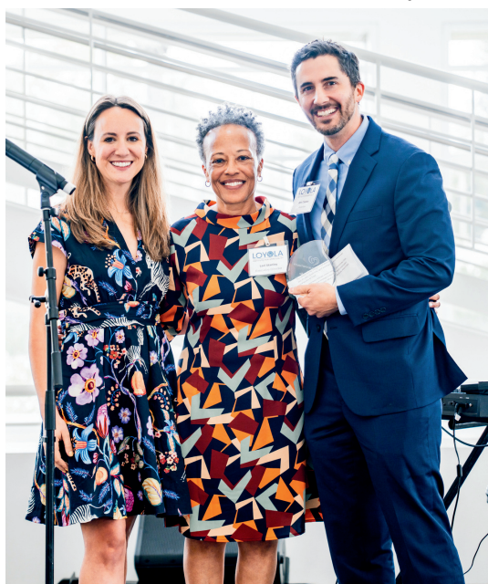
Hearts on Fire