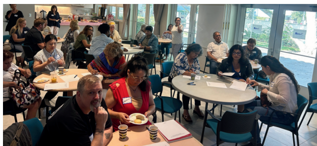
La Cueva Retreat