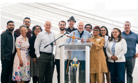
Hearts on Fire Award 2024: JRJI