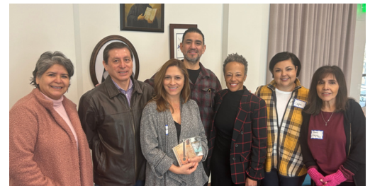
Saturday Series: Celebrating Advent