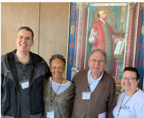
Jesuit Spiritual Ministries Gathering