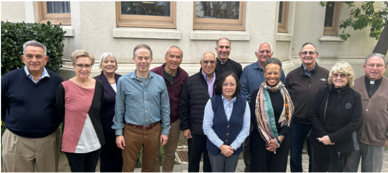
LIS Board Retreat 2024

Your gift enables us to continue to offer a range of programs both online and in person in English and Spanish at modest prices, where individuals are invited to grow in self-knowledge and deepen their awareness of God's presence in their lives. Program evaluations reflect that we are meeting the spiritual needs of people who are eager to share their transformative experiences. Loyola Institute for Spirituality cannot exist without your benevolence. As the numbers show, the generous financial support from our community is essential to our ministry, as is the contribution of thousands of hours from dedicated volunteers. Your gift helps us to expand LIS's reach and offer excellent programming that meets the spiritual needs of Christians today.