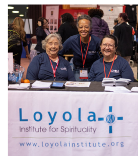
2024 LA Religious Education Congress