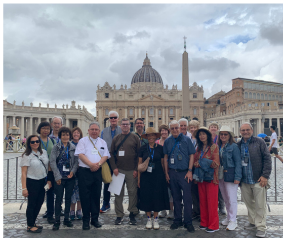
Pilgrimage to Italy: In the Footsteps of the Saints