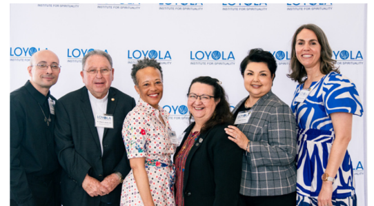
LIS Team at Hearts on Fire 2024