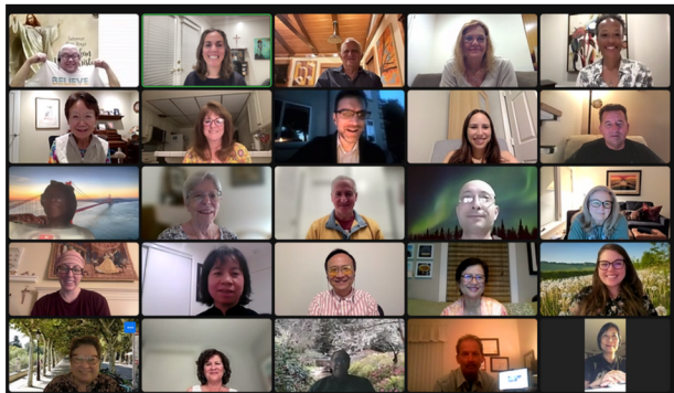
2023-2024 SEDL retreat