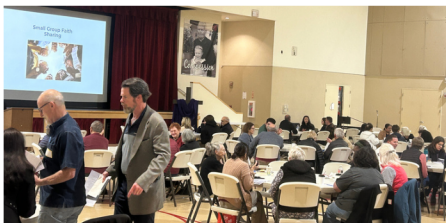
Parish Lenten Retreat