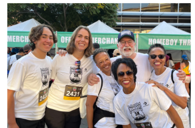
2023 Homeboy 5k